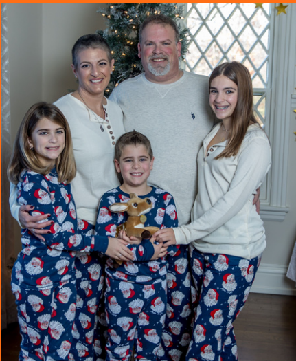
Hope Nation helped 383 Families through our holiday Adopt-A-Family Program so Families were able to have a joyful holiday season.

in grocery support during their cancer journey.