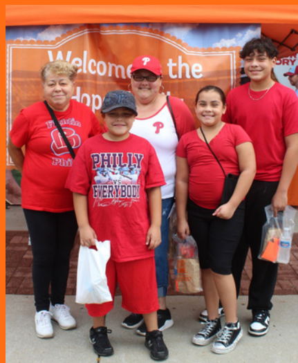
Over 115 Families gathered at our 8th Annual Hope Family Reunion to spend a day at the ballpark with their loved ones.