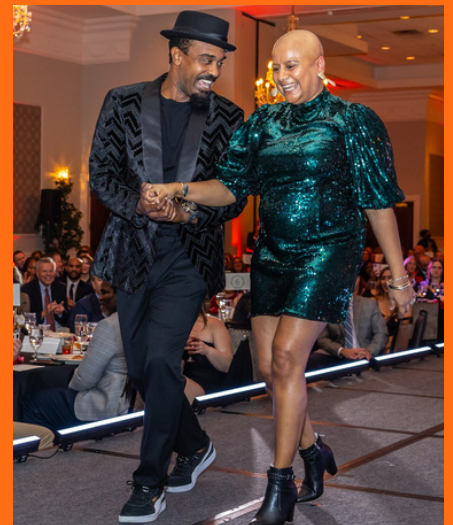
Families & social workers hit the runway at our 13th Annual Ella Bella Fashion Show that raised over $223,000 & helped over 160 local Families battling cancer.